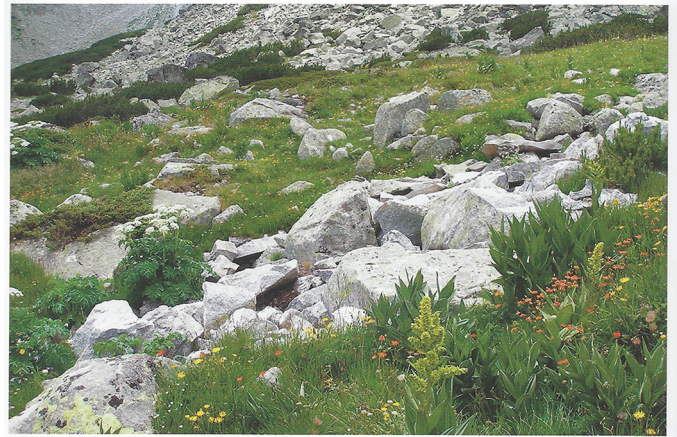
Plate 22: Sub-alpine meadows in the Rila Mountains.